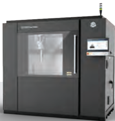
EXT 800 Titan Pellet