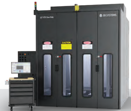
EXT 1270 Titan Pellet