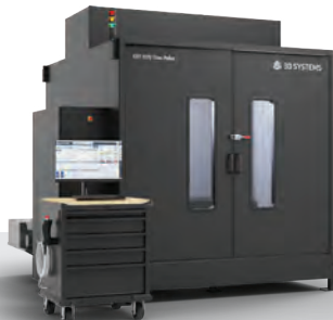
EXT 1070 Titan Pellet / LT